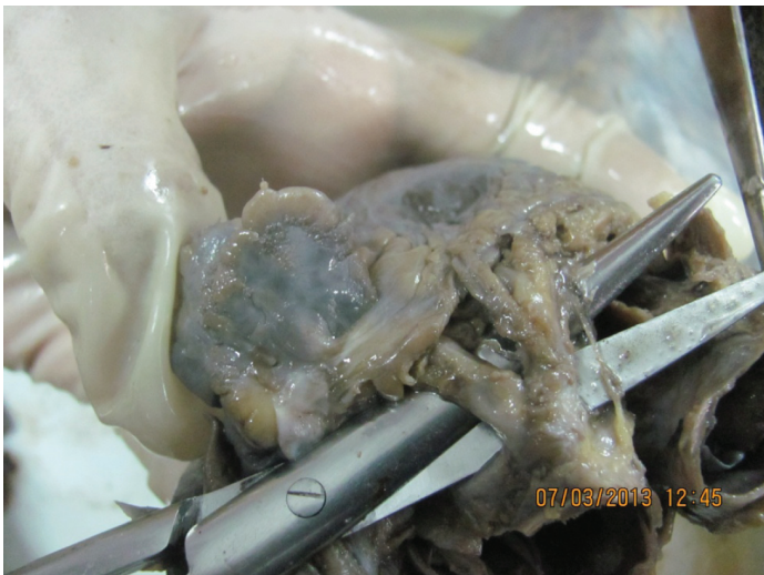
[Table/Fig-2]: Short length of left main coronary artery