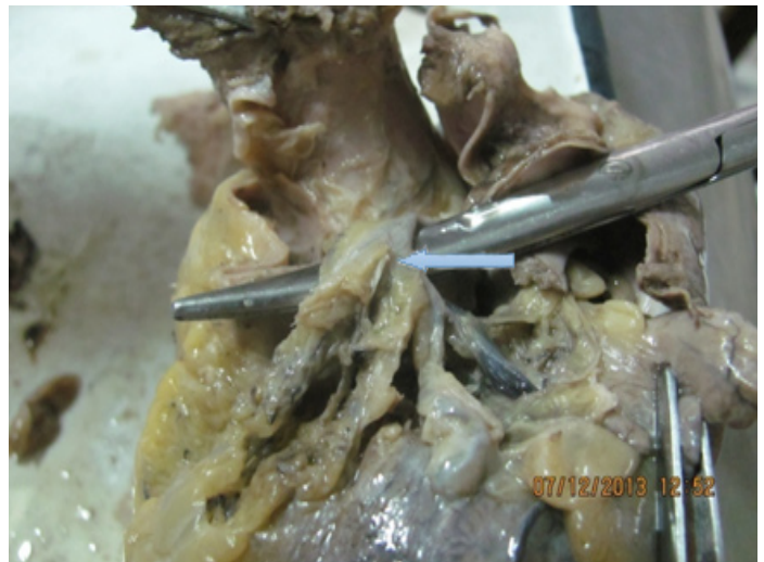
[Table/Fig-4b]: Tetrafurcation of LMCA