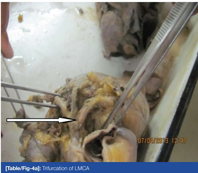
[Table/Fig-4a]: Trifurcation of LMCA